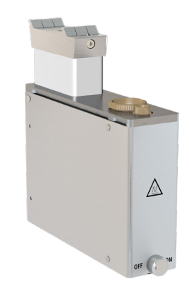
SPME Arrow Conditioning Module