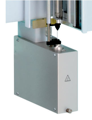
SPME fiber Conditioning Module