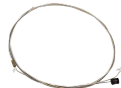
Tubing for connection of Dilutor Tool