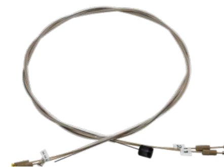
Tubing for connection of LC/MS Tool