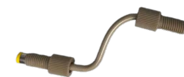
Tubing for HF Fast Wash Module