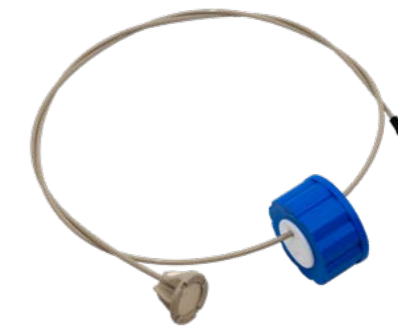
Solvent Inlet Kit incl. tubing, filter and cap